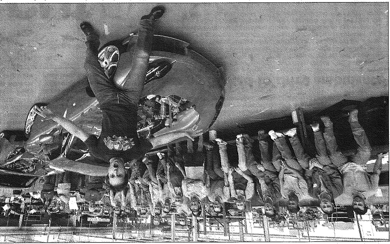
Production line: Alfie Boe entertains staff at the TVR sports car factory in Blackpool, where he once worked as a mechanic

EX-MECHANIC MOVES FROM CLASSIC CARS TO THE